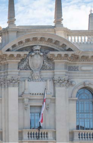
// Facade of the Politecnico di Milano, Leonardo Campus //