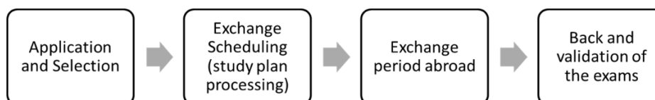
Figure 1 – International mobility process phases

Whatever the international exchange of interest to a student (Erasmus, Double Degree, special programs), the process does not change, and it is structured into four phases (Figure 1): (i) application to a mobility call and selection/admission, (ii) preparing the exchange (with the study plan processing), (iii) exchange period abroad, (iv) validation of the results achieved during the exchange period, upon the student's return.