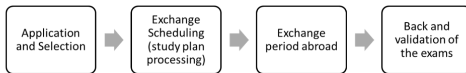
Figure 1 – International mobility process phases

Whatever the international exchange of interest to a student (Erasmus, Double Degree, special programs), the process does not change, and it is structured into four phases (Figure 1): (i) application to a mobility call and selection/admission, (ii) preparing the exchange (with the study plan processing), (iii) exchange period abroad, (iv) validation of the results achieved during the exchange period, upon the student's return.